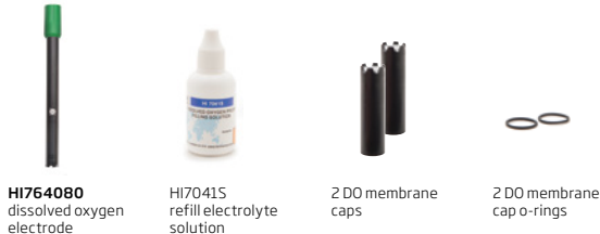
HI764080 dissolved oxygen electrode

edge®DO: HI2004-01 (115V) and HI2004-02 (230V) also includes: