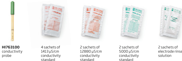
HI763100 conductivity probe

edge®EC: HI2003-01 (115V) and HI2003-02 (230V) also includes: