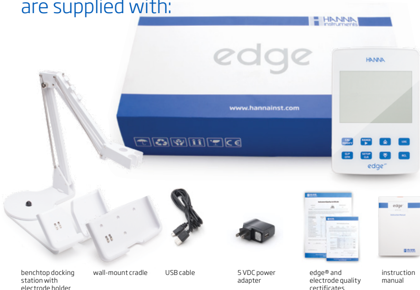
benchtop docking station with electrode holder

All edge® single parameter meters are supplied with: