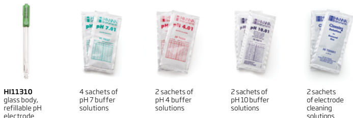
HI11310 glass body, refillable pH electrode

edge®pH: HI2002-01 (115V) and HI2002-02 (230V) also includes: