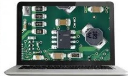
3 in 1 Digital Microscope