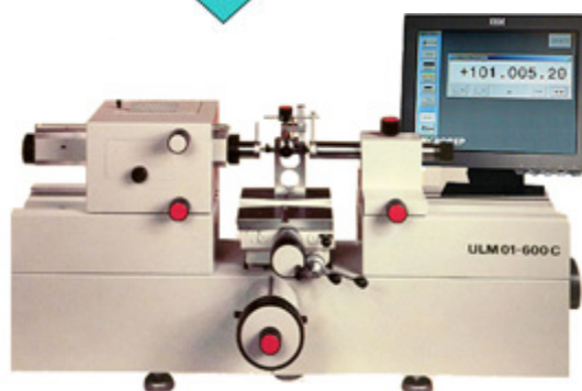
System Upgraded with Retrofit Kit