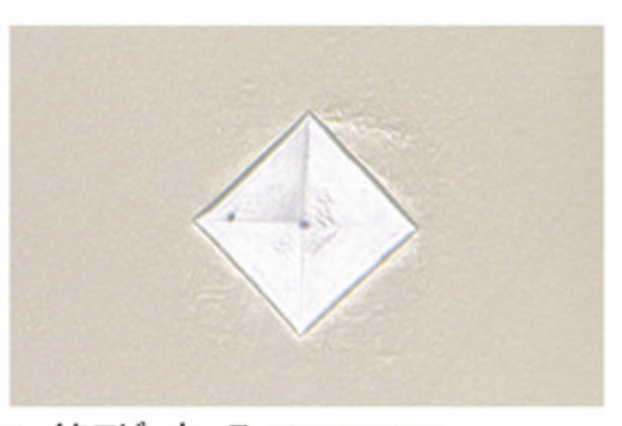
マイクロビッカース Micro Vickers