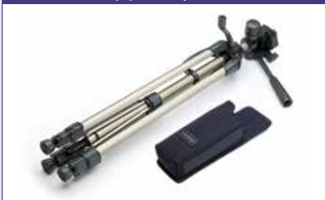
Tripod adapter, tripod, calibration certificate, belt pouch.