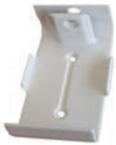
optional wall mounting bracket