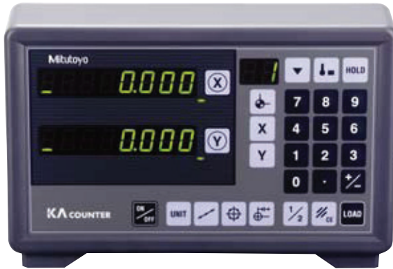
174-173 (for 1-axis or 2-axis)