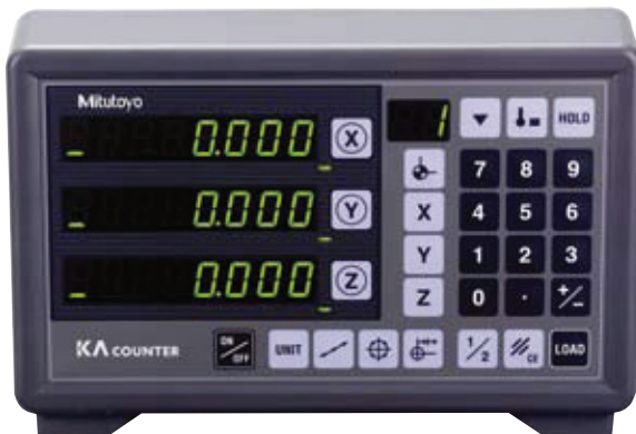
174-175 (for 3-axis)