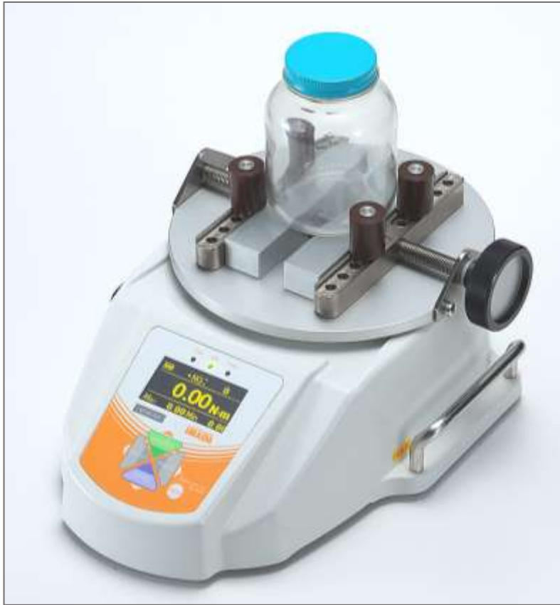
[The image of torque measurements of a bottle cap]

It measures opening/closing torque of PET or glass bottles, keys or camera lenses torque. Ideal torque measurements are possible by the varieties of the tables and the pins which put and hold samples properly. The torque gauge captures small torque changes. It realizes high repeatability measurements accurately and easily.