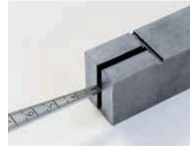
Measurement of gap width