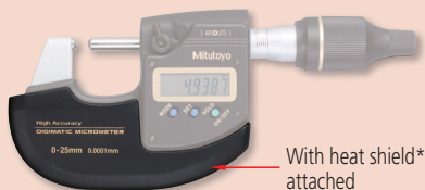
With heat shield* attached

Heat shield (No.04AAB969A: 293-100 No.04AAB969B: 293-130) x 1 Lithium battery CR2032 (1 pc), for initial operational checks (standard accessory) Spanner (No.200877) x 1 Screwdriver (No.04AAB985) x 1 Cleaning paper for measuring faces Inspection certificate