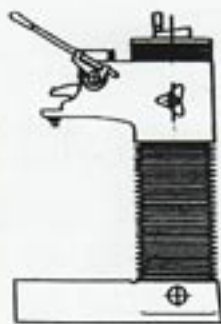
STAND N conventional