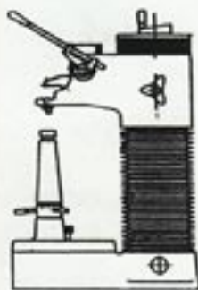
STAND T the most versatile