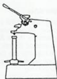
STAND CAR mobile